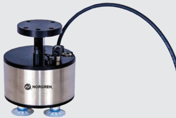
NCRVT collaborative robot vacuum tool