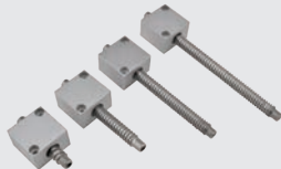
Heavy duty spring levelers