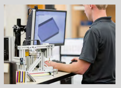
ATLAS Controls Engineering

Hartfiel Automation's Value-Add team provide much more than just assembly and light manufacturing support - they bring the experience to quickly and efficiently design, test, and deliver the best solution for your assets.