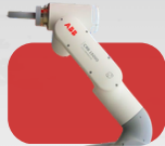
ABB GoFa Fundamentals